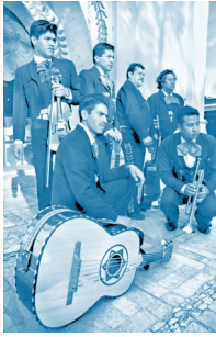
Spring Concert May 26th